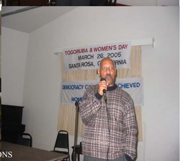
WOMEN'S DAY AND TOGORUBA CELEBRATIONS