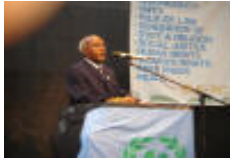
Amanuel Habte , Rep. USA